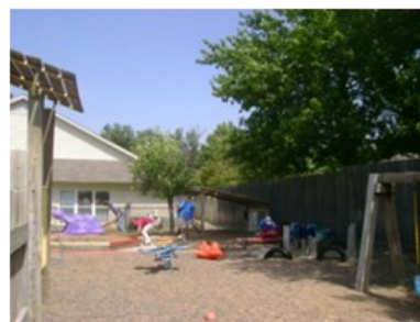
Target volunteers building a playground