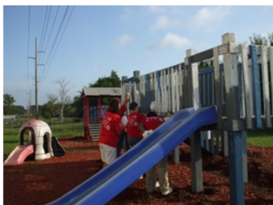
Williams volunteers building a playground

Approximately 200 volunteers from 12 companies completed 19 projects for 18 different child care facilities during the Tulsa Area United Way's Annual Day of Caring. These projects included building playground equipment, cleaning and organizing classrooms, painting parking lots, painting classrooms, installing tile and reading to children.