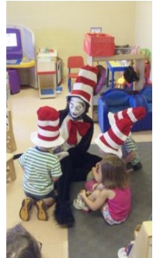
GableGotwals volunteers reading to children

31 families spoke another language other than English and needed care.